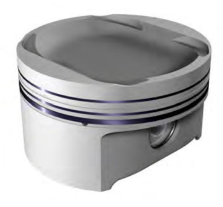
Cayenne Turbo Piston

The pistons for the turbocharged engines are forged.