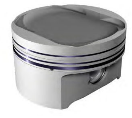
Cayenne S Piston

The pistons for the naturally aspirated engines are cast.